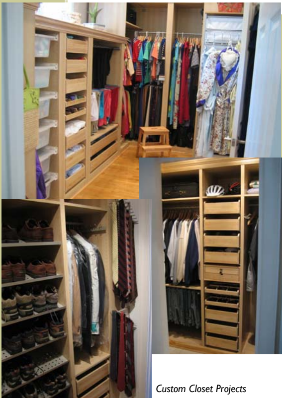
Custom Closet Projects

We create custom designed walk-in and wall closet systems featuring space for drawers, folded items, and hanging items. Clever organizers for ties, belts, scarves, jewelry, shoes and much more can be incorporated to suit your specific needs. Crown molding across the top creates a beautiful, built-in look.