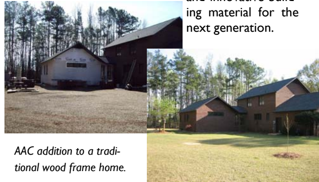
AAC addition to a traditional wood frame home.

and innovative building material for the next generation.