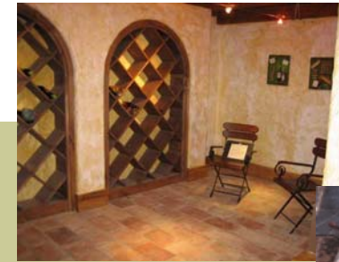
Our antique terracotta floor featured in a wine cellar of a show house in Raleigh, NC.

Vintage Elements is our antique building materials division of the business. We import antique reclaimed building