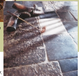
Antique Belgium Bluestone floor.

Vintage Elements is our antique building materials division of the business. We import antique reclaimed building